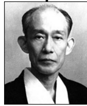
Kisshomaru Ueshiba Aikikai