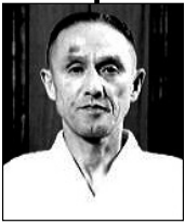
Gozo Shioda Yoshinkai/Yoshinkan

This is not a definitive list of Aikido schools/sensei, but a list of teachers who have had great impact on Aikido and who you will want to read about. You can google them. With the exception of Koichi Tohei Sensei, all teachers pictured here have passed on, but their school/style/tradition of Aikido has been continued by their students. All of these styles of Aikido are taught in the United States, as well as in many other countries throughout the world.