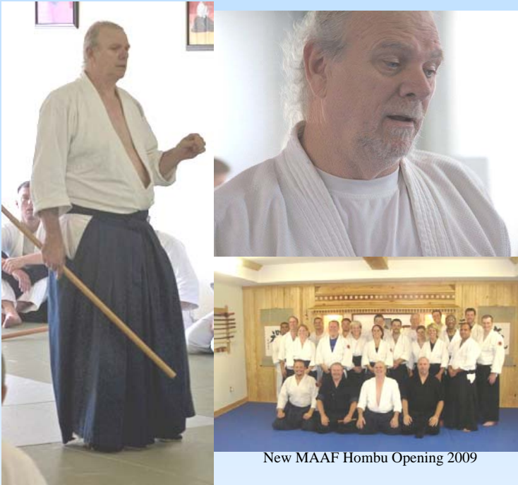
New MAAF Hombu Opening 2009